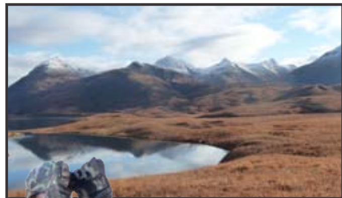
(ABOVE) TYPICAL KODIAK BEAR COUNTRY. MOST BEARS ARE LOCATED BY GLASSING (LEFT).